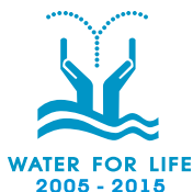
WATER FOR LIFE 2005 - 2015