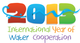
International Year of Water Cooperation

- The proclamation of 2003 the International Year of Fresh water (UN General Assembly Resolution of December 20, 2000, 55/196, 55th session);