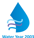
Water Year 2003

The General Assembly of the United Nations adopted the following important resolutions initiated by the Republic of Tajikistan: